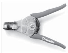
Cable Stripping Tool w/16 awg Blades ST-1 (393510)