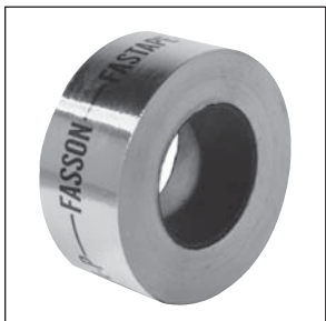
Aluminum Tape Cable Attachments AT-1 (383355)

5 electric heat tracing caution labels, weather resistant.