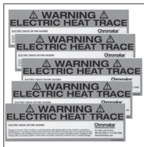
Caution Labels CL-1 (382424)

66 foot roll glass cloth tape with pressure-sensitive thermosetting silicone adhesive 3/8" wide. 310°F (155°C) rating. Strap at one foot intervals at minimum application temperatures of -40°F (-40°C).