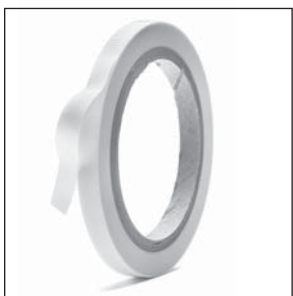
Fiberglass® Tape Cable Attachments FT-3 (389941)

Interlock Straps for larger diameter pipes