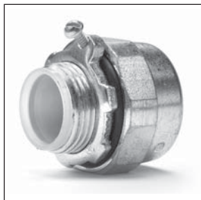
Conduit Hub Cable Attachments CCH-2 (385650)

Corrosion resistant for 3/4" conduit. Fits opening in RTPC and PJB. Includes a ground connector.